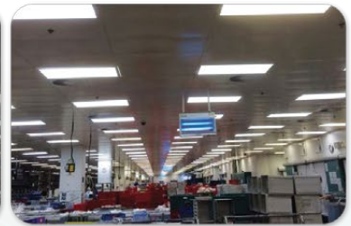
CATHAY PACIFIC CATERING SERVICES