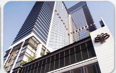
HARBOUR PLAZA HOTEL