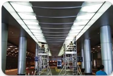
CHEUNG KONG CENTER