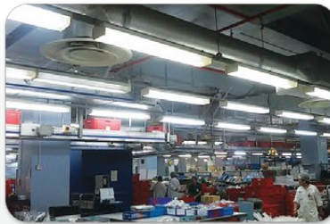
CATHAY PACIFIC CATERING SERVICES