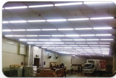
CHEUNG KONG CENTER